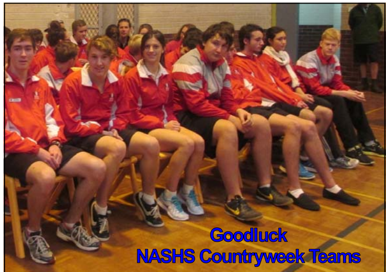
Goodluck NASHS Countryweek Teams