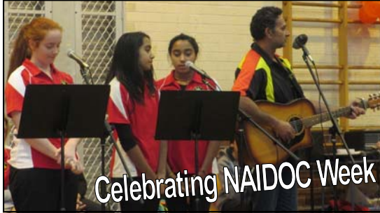
Celebrating NAIDOC Week