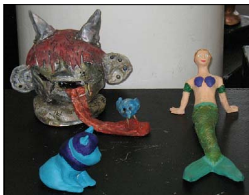
Sculptures by NASHS students.