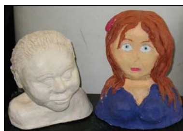
Sculptures by NASHS students.