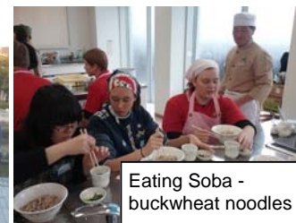
Eating Soba - buckwheat noodles