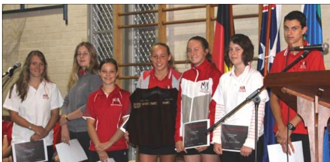
NASHS 2016 Dux Awards