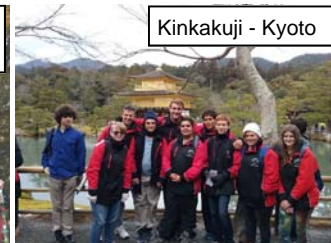
Kinkakuji - Kyoto