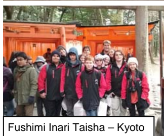
Fushimi Inari Taisha – Kyoto