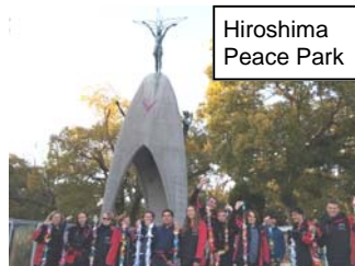
Hiroshima Peace Park