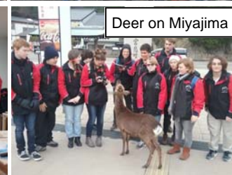
Deer on Miyajima