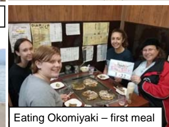
Eating Okonomiyaki – first meal